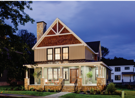
OCTOBER 8-9-10 SAT-SUN-MON