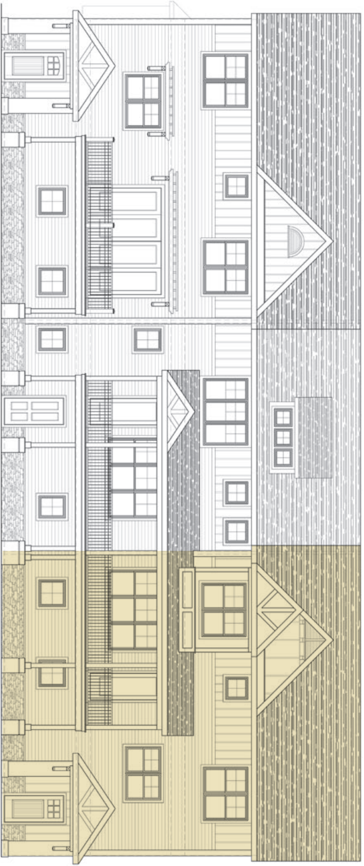
F R O N T